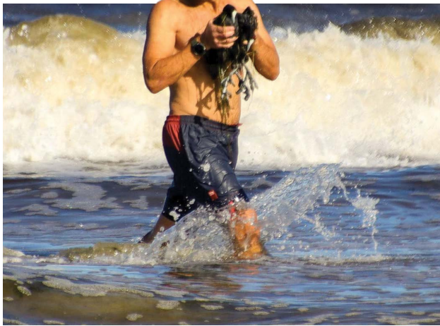
LEFT & RIGHT: Volunteers young and old helped to rescue the birds in distress. MIDDLE: Klein River Lagoon after it was allegedly illegally breached on Sunday morning.