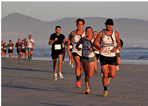
The HI-TEC Walker Bay Outdoor sports festival took place in and around Hermanus from 28 April to 1 May. Athletes competed in various events including the Ledlenser Twilight Run, the See-en-Sand Swim Run Jump, and the WBO Mountain Biking.

Running enthusiasts were up early on Saturday morning to take part in the WBO Trail Run with an option of a 14.6 km or 19.6 km route. The race started at the Hermanus Cricket Club, wound through the hills of the Overberg and then returned to the Hermanus Cricket Club where a crowd had gathered to cheer the